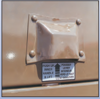
Gravitational latch on all doors.