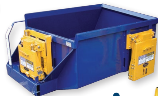
VBTL Curb/ TL Front Mount