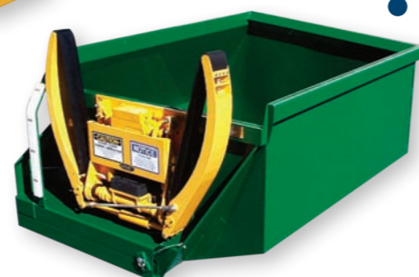
GTL Curb Mount